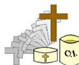
Sacrament of Anointing